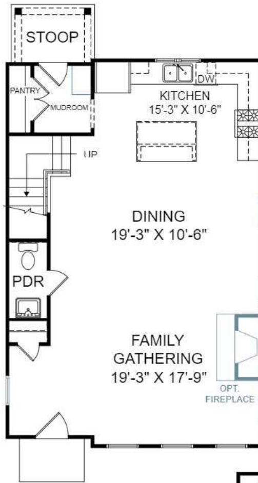
Main Level Floorplan with options

*ILLUSTRATIVE PURPOSES ONLY OPTIONS SHOWN IN BLUE